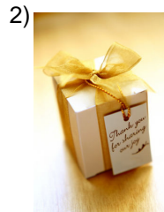
thank you very much