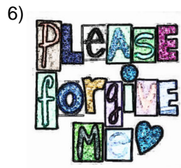
forgive me, excuse me